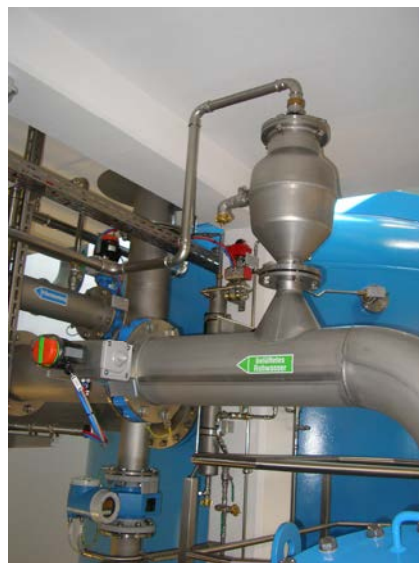
Sample installation in filter unit