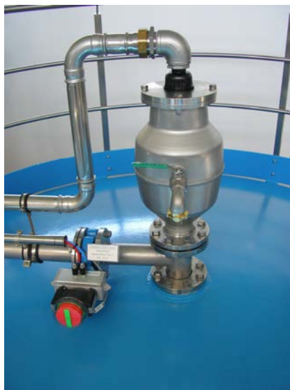
Sample installation on oxidizer tank