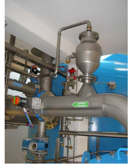
Sample installation in filter unit