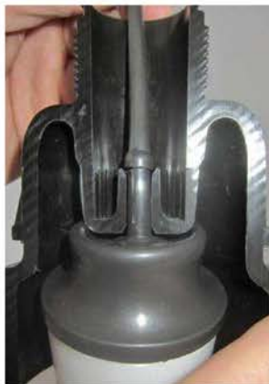
(Upper air valve part in cut sample view)

15. The rest of the assembly follows the steps vice versa 9 through 10 of this manual. Visual check of all connections and flushing openings.